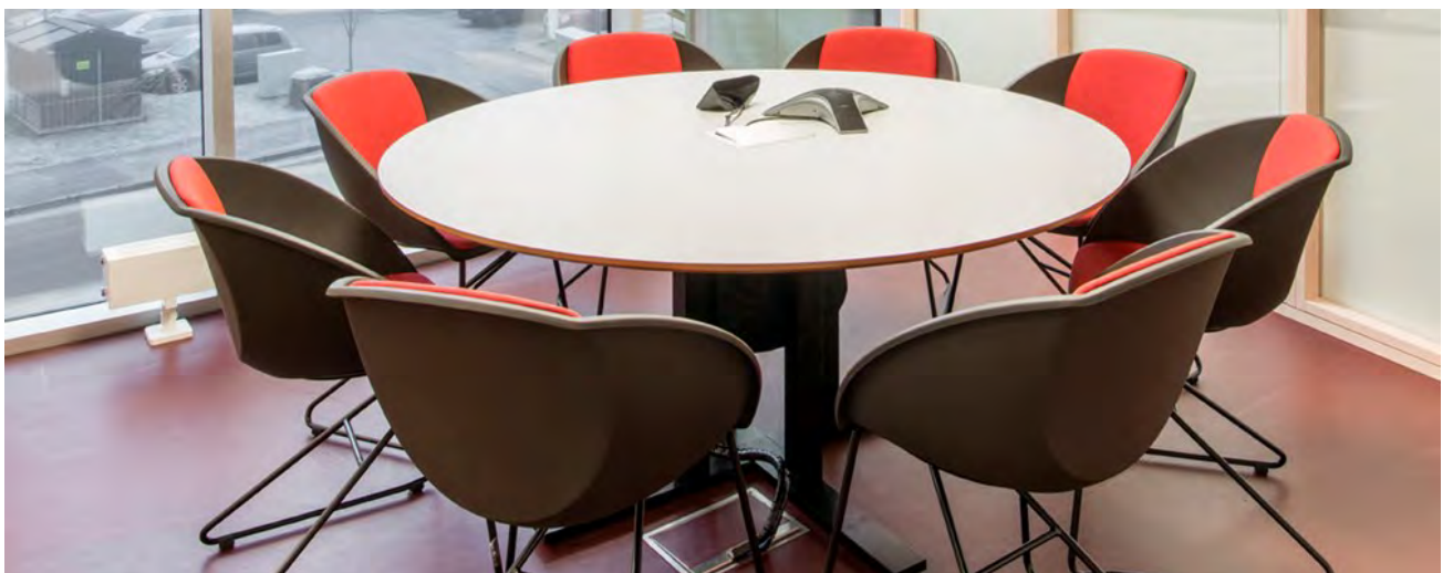
Popcorn chairs with seat and back cushion.