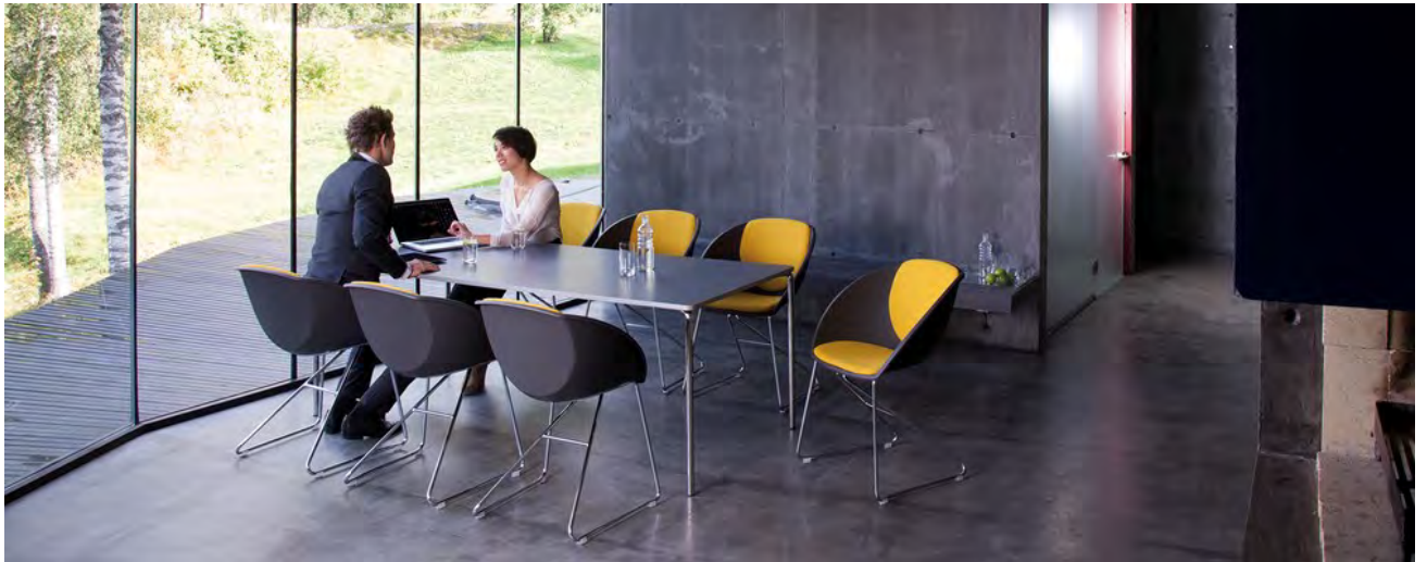
Popcorn chairs and Clip table.