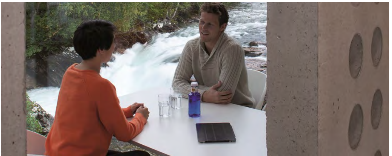
Popcorn chairs and Clip table.